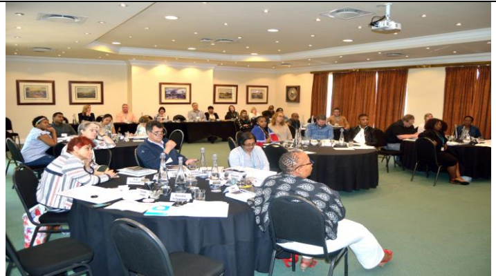
Figure 1: SASOP ECPs and their lecturers at the Registrar Finishing school. Johannesburg; November 2017

Future activities of the ECPs include planning symposia and social events at the next SASOP congress in September 2018. Beyond our borders, the section is actively pursuing forming a bond with all ECP formations across Africa. We are working closely with other neighbouring countries, collaborating with them in growing and developing both academic excellence and patient care in the region.